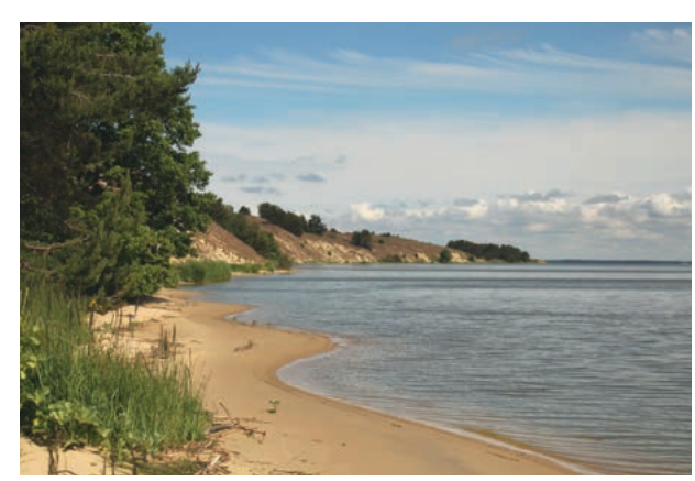
Curonian Spit

The project partners and associated partners include World Heritage sites and Biosphere Reserve Areas in the South Baltic region who face similar conservation, preservation and social challenges.